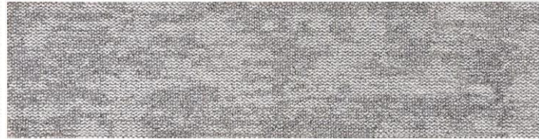
FLUORITE GREY MI 8760