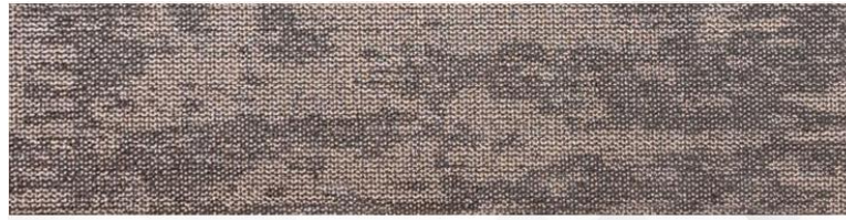
GAMBOGE MI 8710